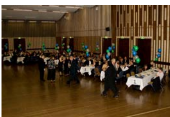
Standards 5 & 6

The Westhaven Ball is a biennial (every two years) event (held purely for the enjoyment of the clients). They love dressing up, the food and the dancing. Staff and clients and client's families are all invited to attend as well as dignitaries as invited guests (Mayor, NSW and Federal MPs, relevant NSW Minister responsible for Disability Services, ADHC Senior Staff). Ex-staff and clients are also included in the invitations as well as clients from other service providers around Dubbo (e.g. Challenge, ADHC, Break Thru PS, Orana Lifestyles) and suppliers to the service. This year it will be held on Saturday 15th October 2011 to coincide with the AGM of The Westhaven Association. This allows families who travel long distances to attend both events on the same weekend. Stay tuned for more info.